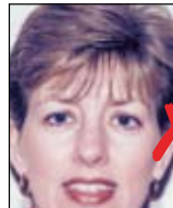
Too close to camera

The following examples show unacceptable photographs and an acceptable photograph.