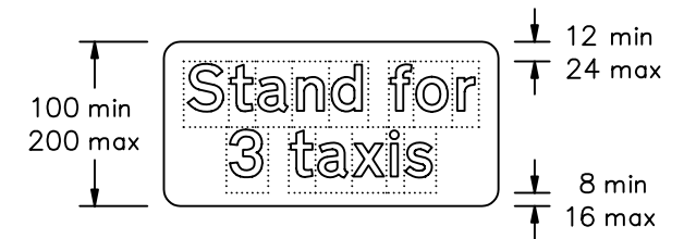
VARIANT : WHITE SPACE OMITTED