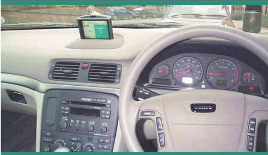
Volvo RTI System