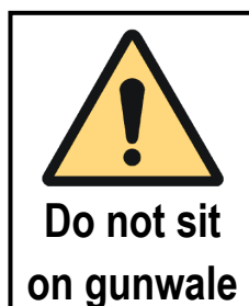
Figure 5 Do not sit or stand on the gunwale (using ISO 7010 – W001 “General warning”)