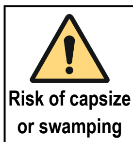
Figure 4 Dinghy is vulnerable to capsize or swamping

NOTE The use of water containers instead of metallic test weights will give a less advantageous result.