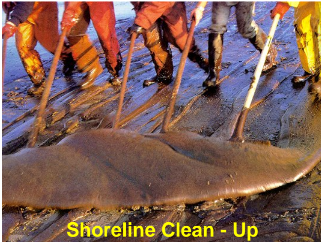
Shoreline Clean - Up