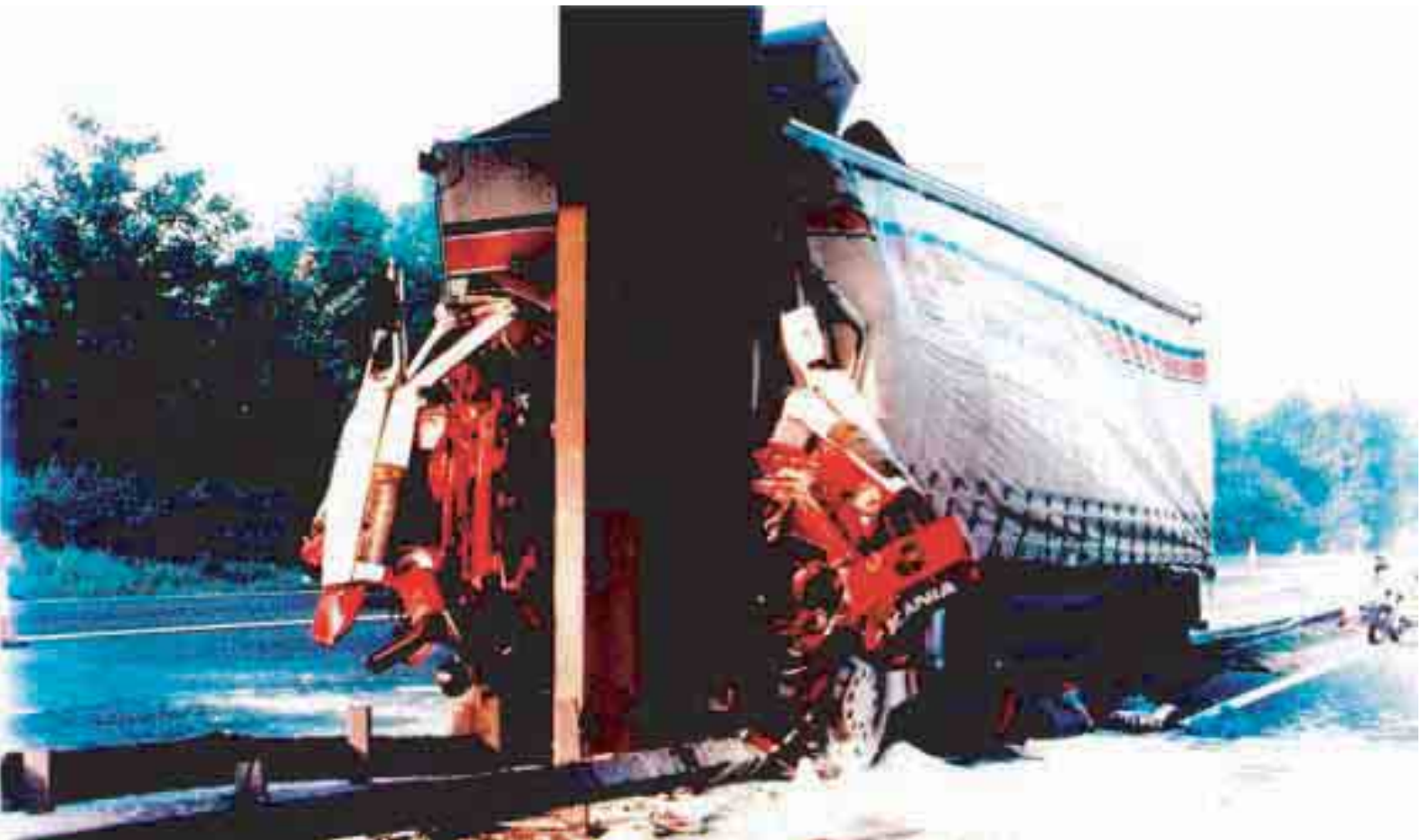
PLATE 1 COLLISION OF HGV WITH REINFORCED CONCRETE SUPPORT M20 MOXLEY ROAD BRIDGE