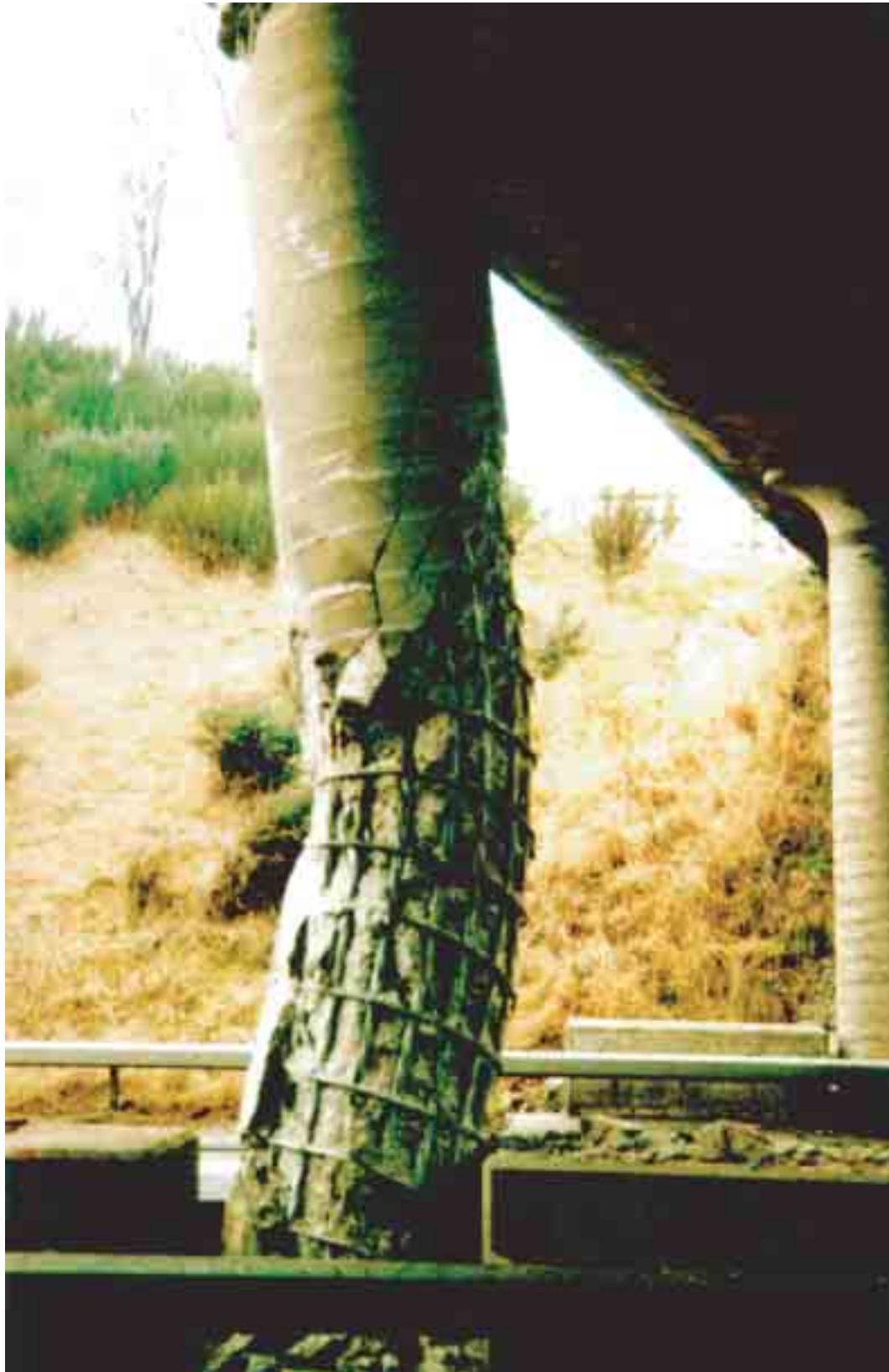
PLATE 3 COLLISION DAMAGE TO REINFORCED CONCRETE CENTRAL SUPPORT M74 LAIRS FLYOVER - B7078