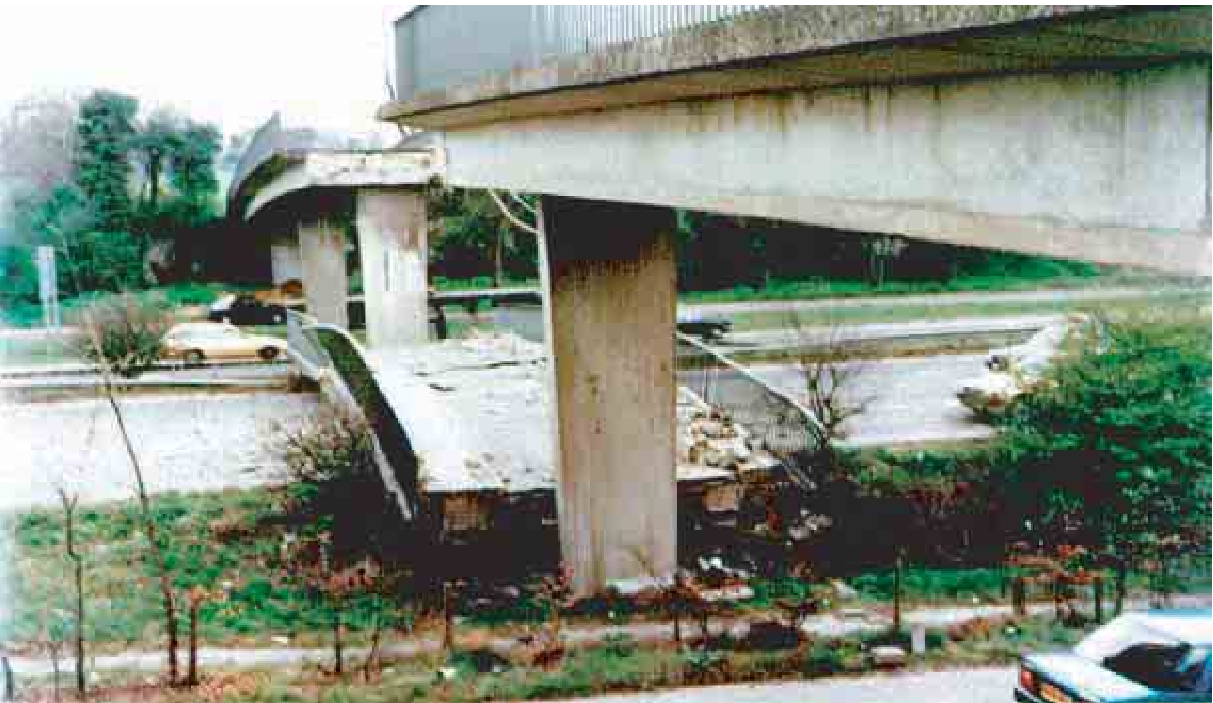
PLATE 2 COLLAPSE OF A DECK SPAN FOLLOWING A COLLISION FROM AN EXCAVATOR TRANSPORTED ON A LOW LOADER A2 PARK PALE ACCOMMODATION BRIDGE